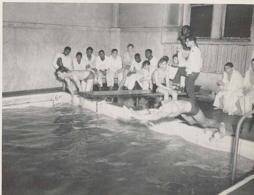
Team looks on as a race begins

Truly, this was a swimming season. It was a season of the most natatory, aquatic character, in which swimming and the athletics of the pool prevailed. The fellows who participated were swimmers first, swimmers last, and swimmers always. They swam, swam, and swam, and splashed the spectators.