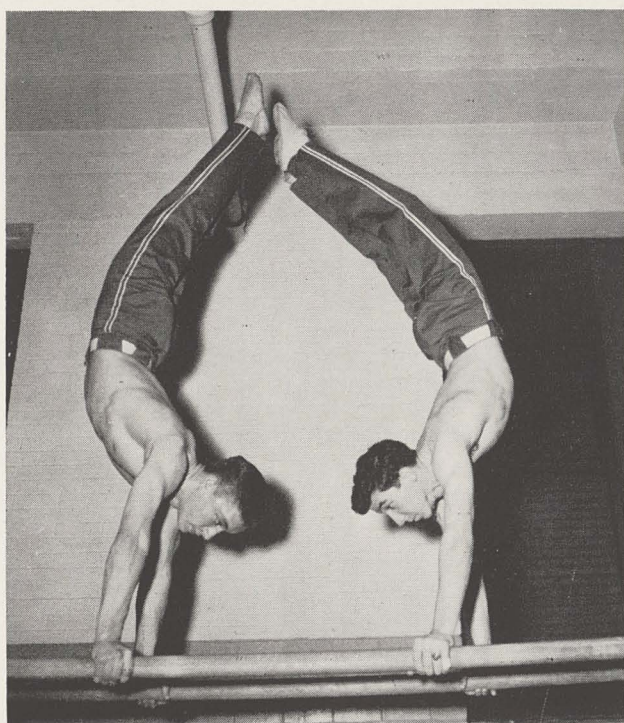
Winning form shown by team members