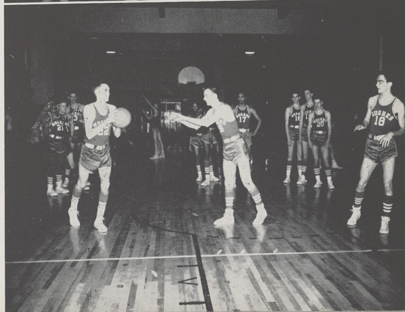
Team warms up with figure-eight drill.

his pivot knowledge surely helped in winning several games, as he averaged six or seven points in a few tough spots.