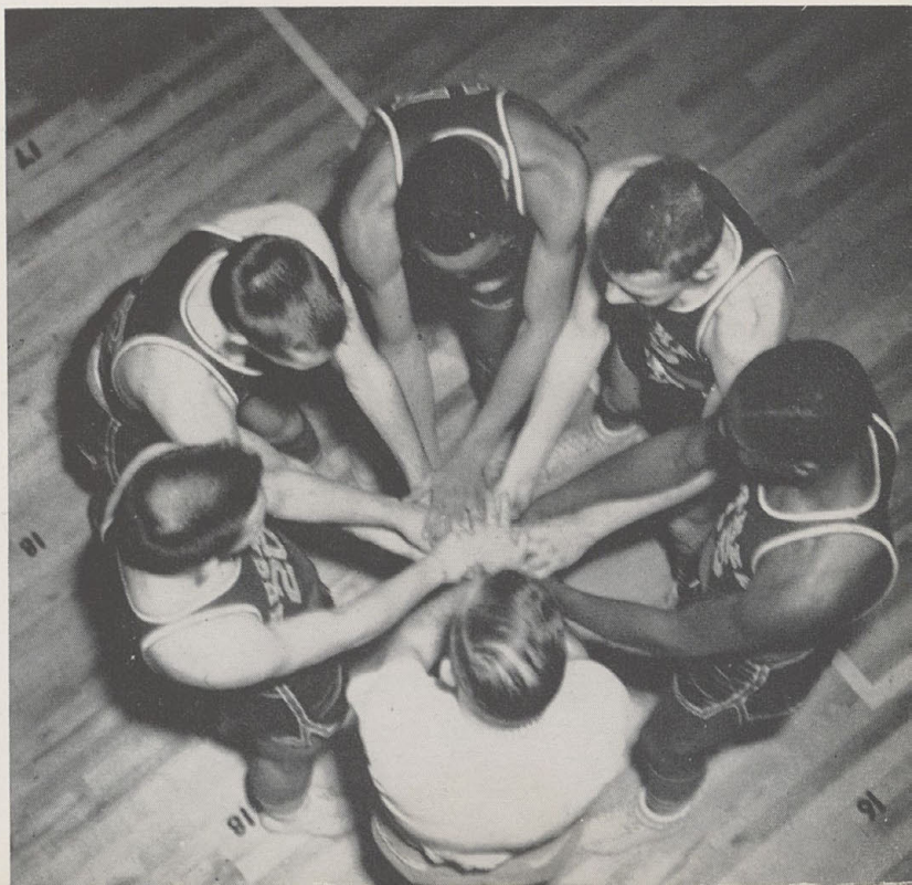
"Big Reds" huddle before game