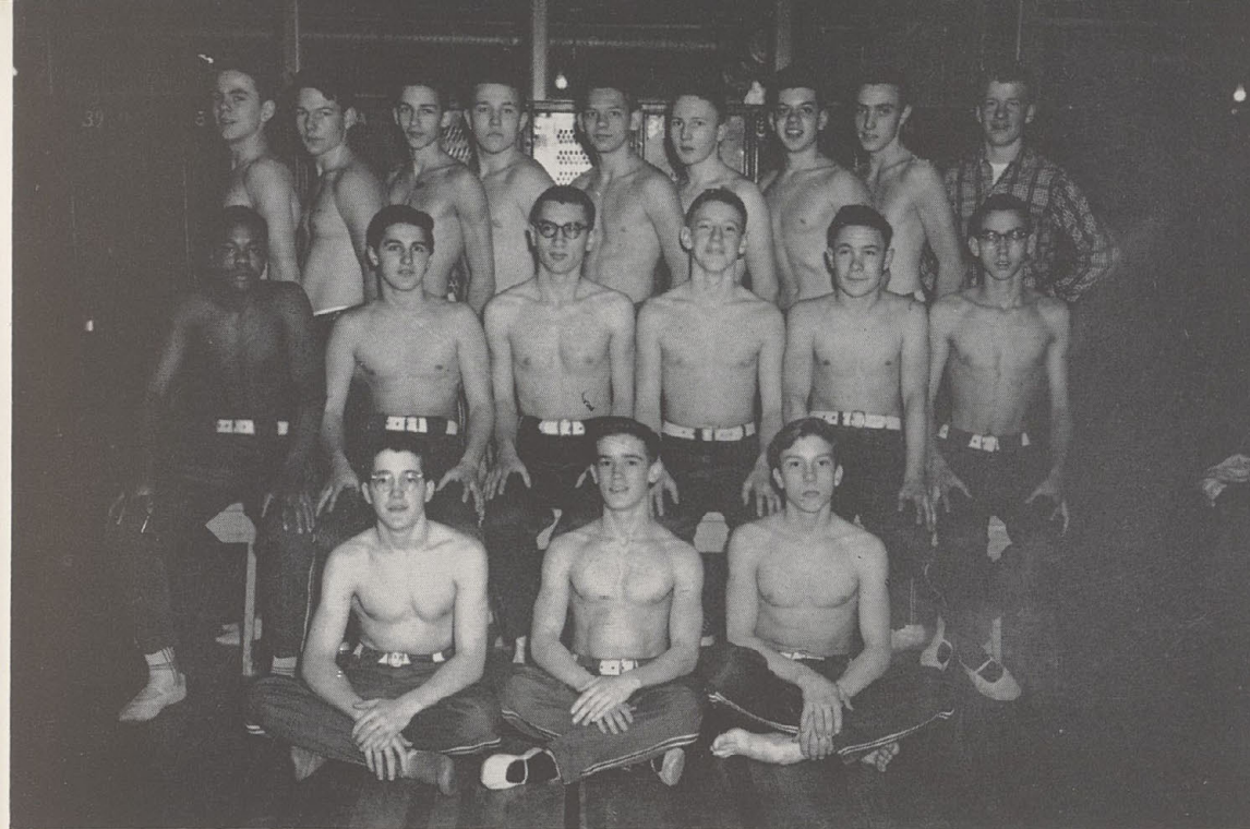
The "little matmen," following in the footsteps of their elder brothers, copped second in P.H.S.L.