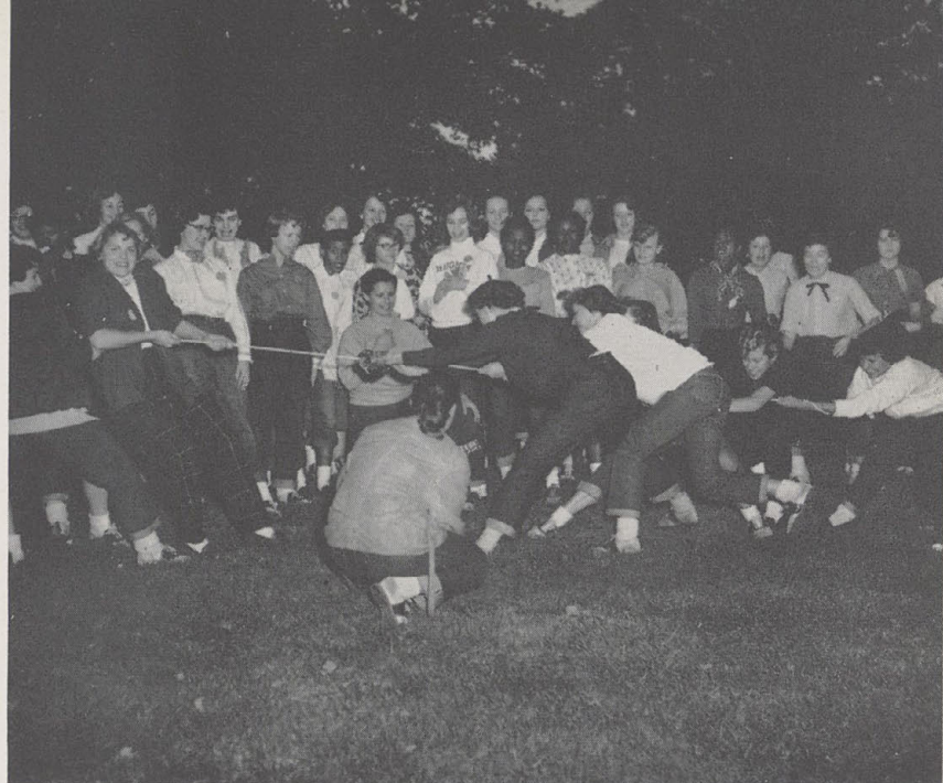
A spirited tug of war heads the events of the annual picnic.