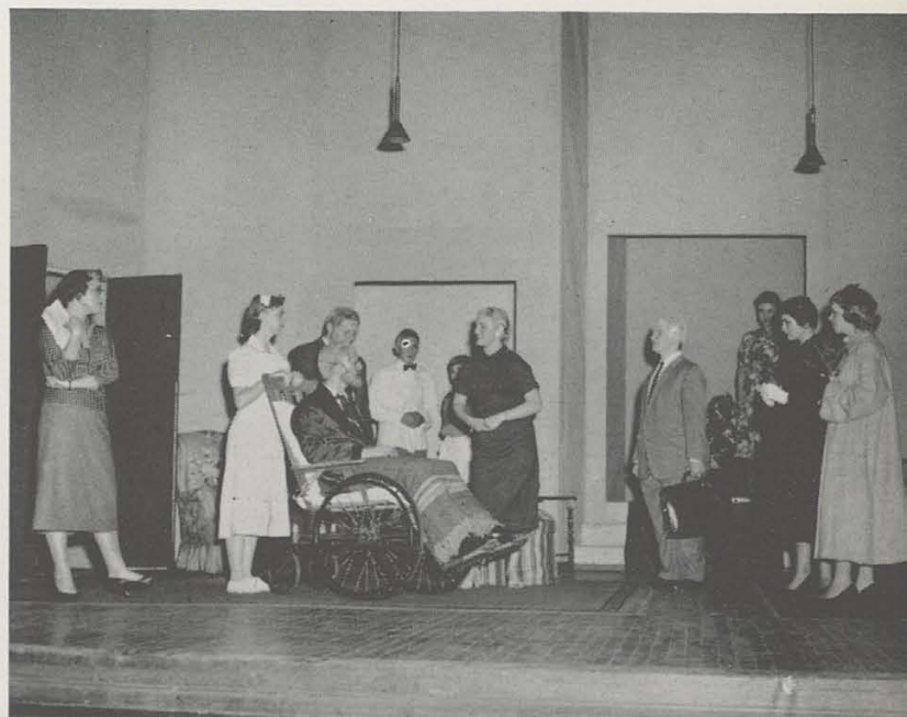
Play principals go through lines for last time at dress rehearsal.