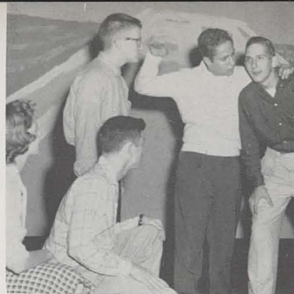
Rehearsal for "Around the World in 80 Days."