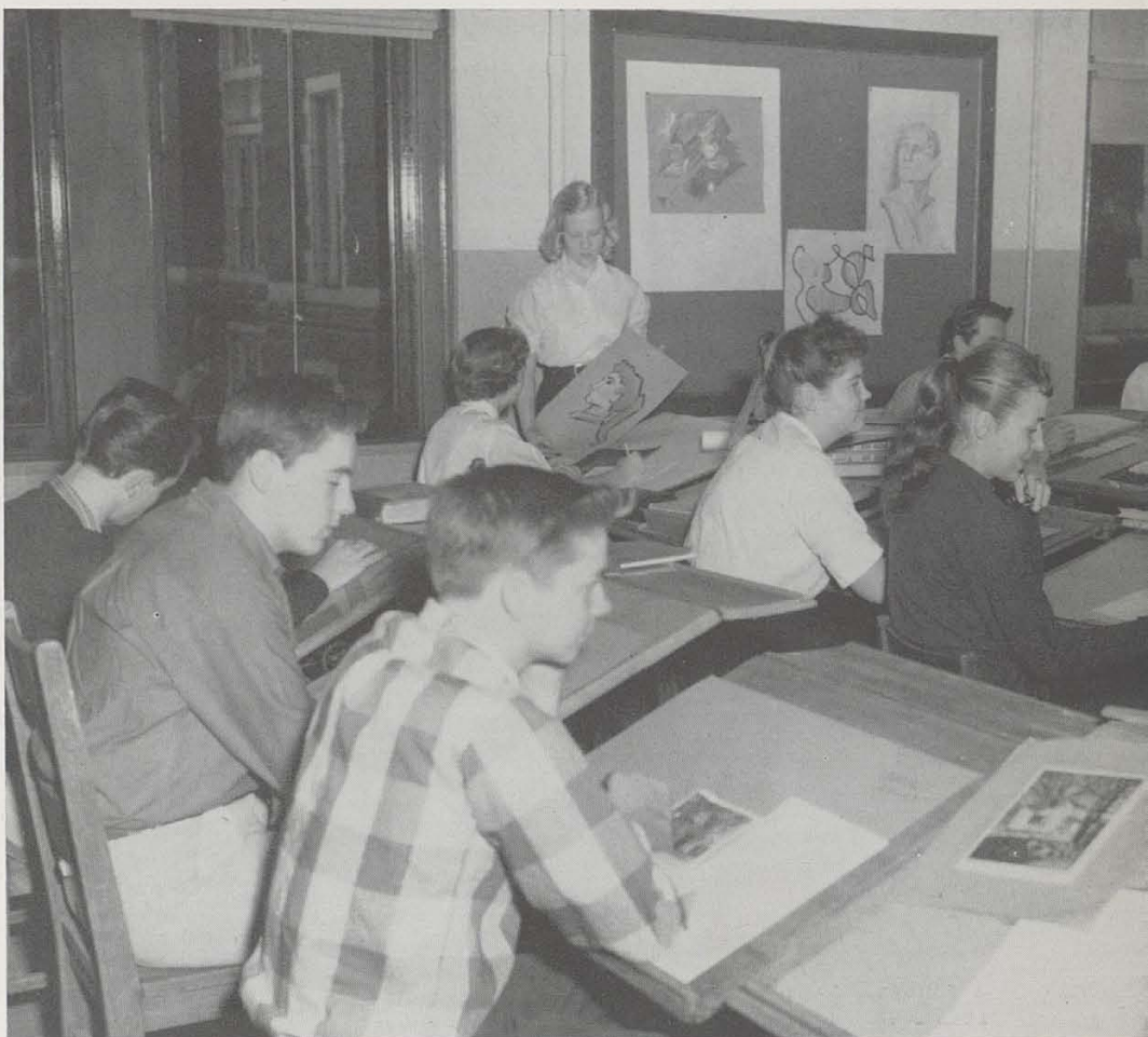
A project being completed by art class.