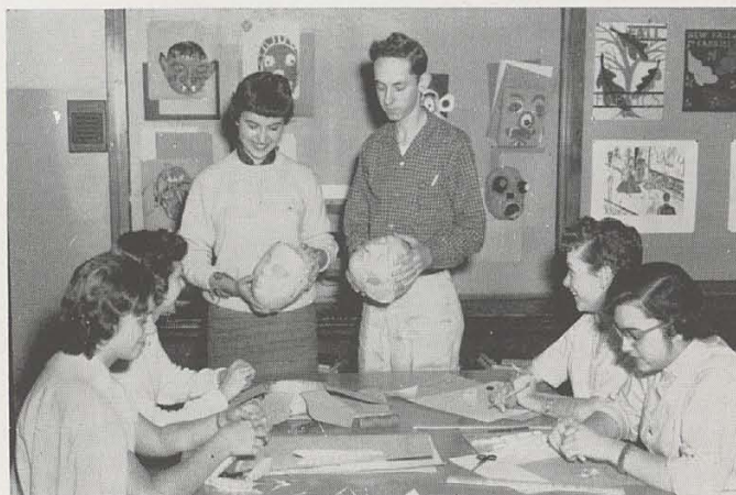
Art students comparing recently completed masks.