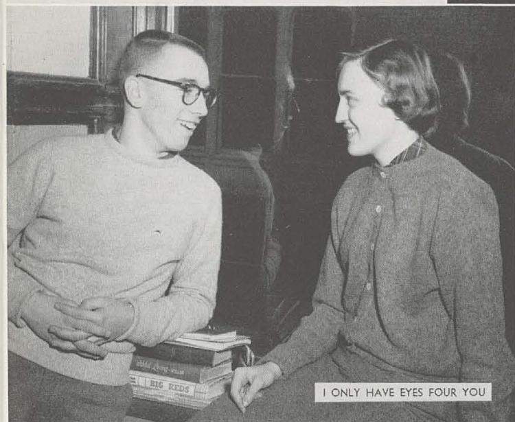
I ONLY HAVE EYES FOUR YOU