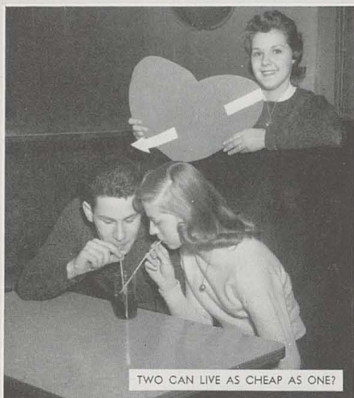
TWO CAN LIVE AS CHEAP AS ONE?