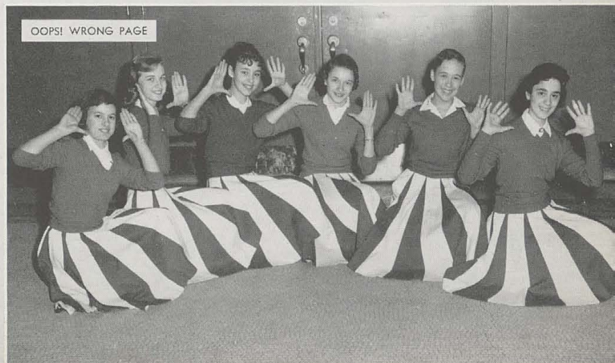
OOPS! WRONG PAGE