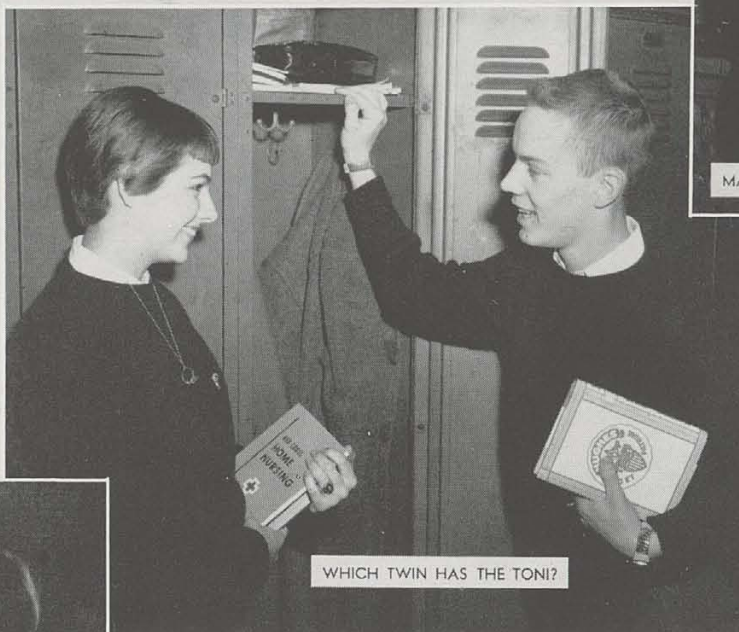
WHICH TWIN HAS THE TONI?