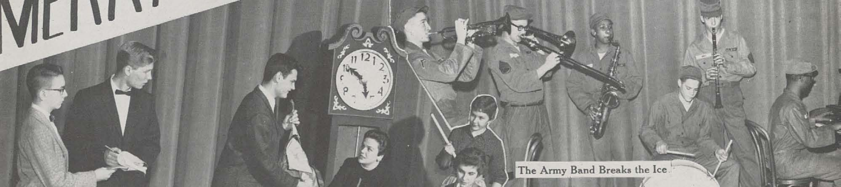
The Army Band Breaks the Ice