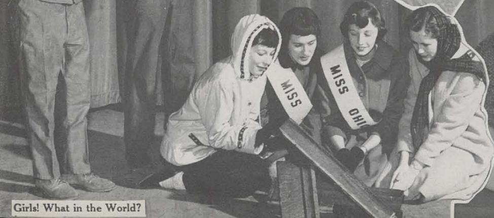
Girls! What in the World?