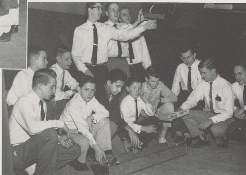
Members of the Stage Crew demonstrate their ability on the spotlight and footlight.