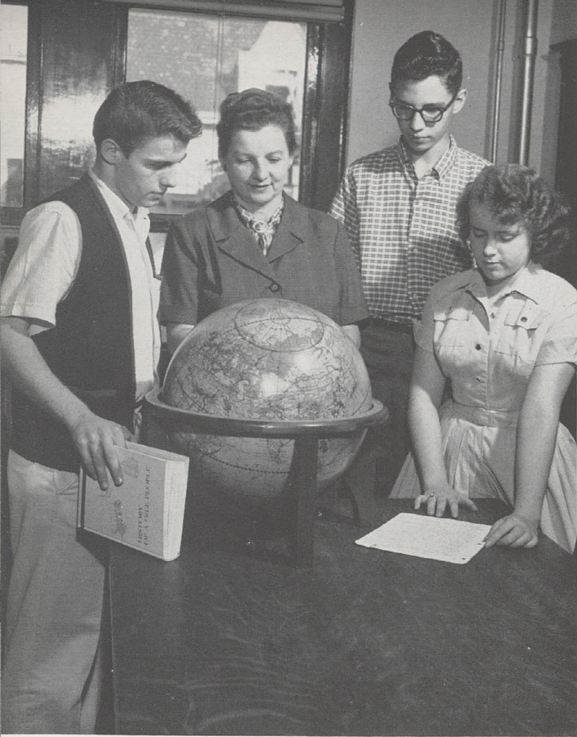
Let's see. Cincinnati must be somewhere around here.