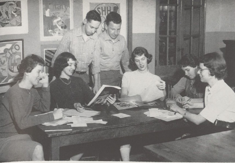
The art staff busies itself making designs to brighten up the pages of the '60 annual.