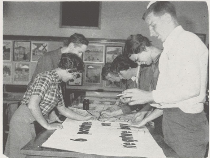
The versatile art students lend their talents to the making of posters.

At Christmas time the art division decorates a large tree in the front hall. This year, for the very first time, the tree was an artificial one. It looked very modernistic in white, red and gold. The uniqueness of the design aroused much comment and enthusiasm among the student body. A picture of the tree may be seen on the opposite page.