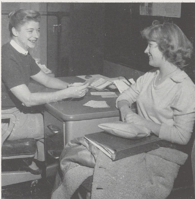
"Now, what may I do for you, Virginia?"