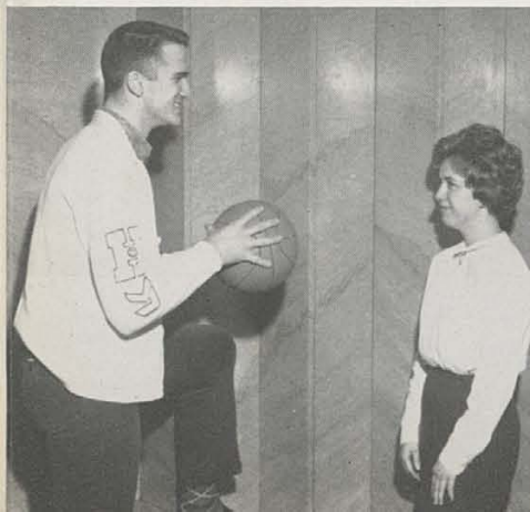
To view the Mr. and Miss Basketball contest?