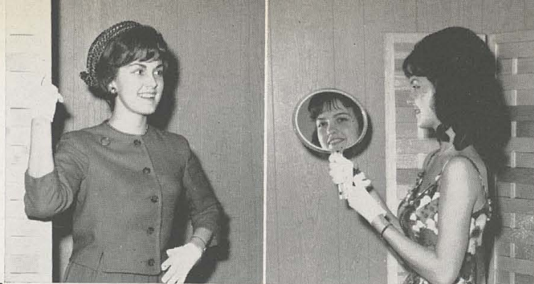
To admire the chic clothes worn by beautiful models at the Honor League Fashion Show? A large attendance helped swell the Scholarship Fund.