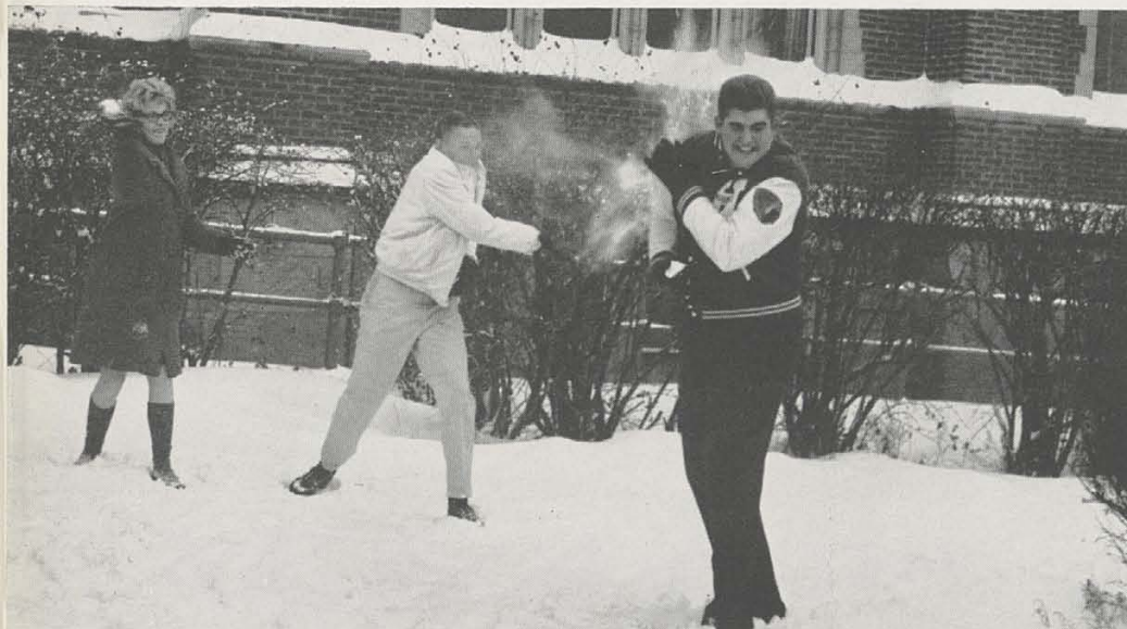
When the snow and cold built up enough to close the Cincinnati public schools? Hooray!