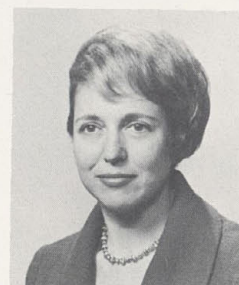
Reabelle Emdin Art