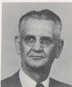
Clyde Hall Mathematics