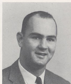
William Hall Business