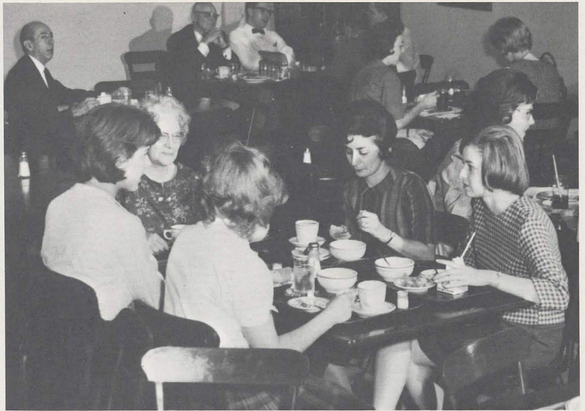
A typical scene in the faculty lunchroom finds lively discussions of everything from the Beatles to the bomb.