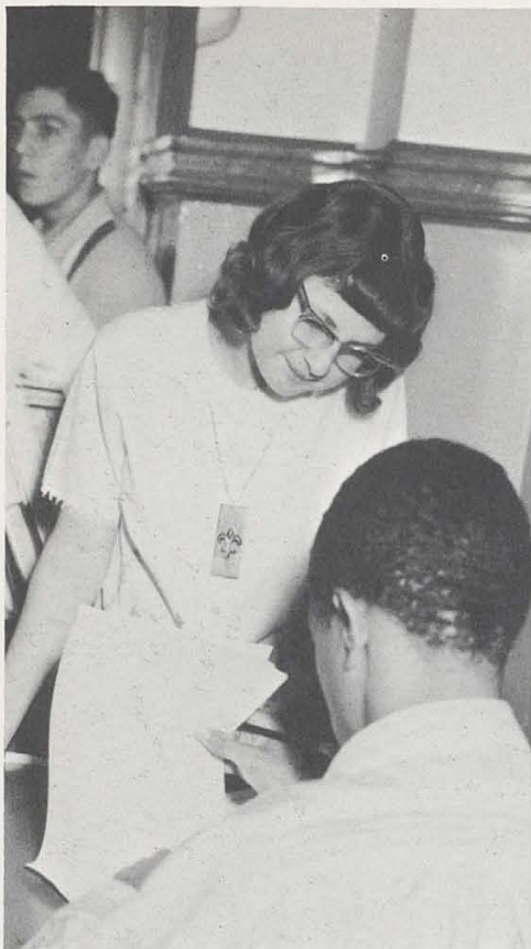
Student casts her vote in mock election.