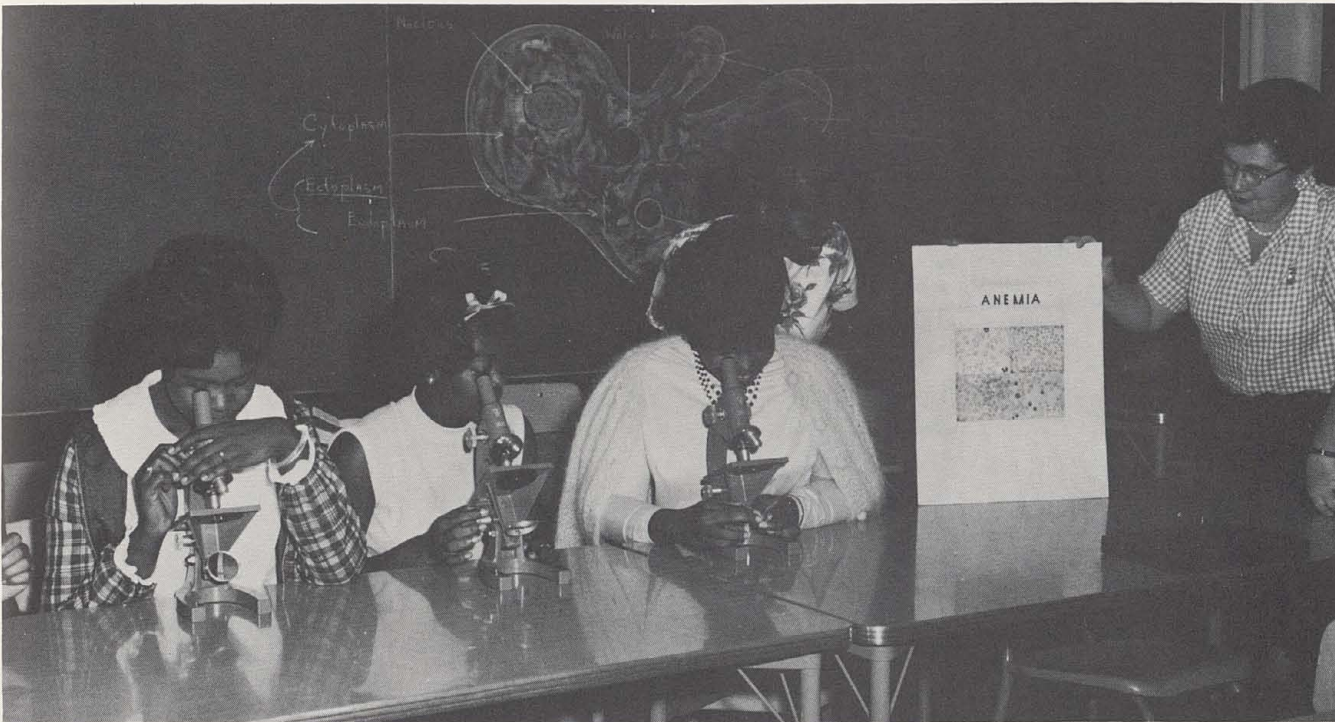
"Can you see them?" Miss Bacon asks the girls at their microscopes.