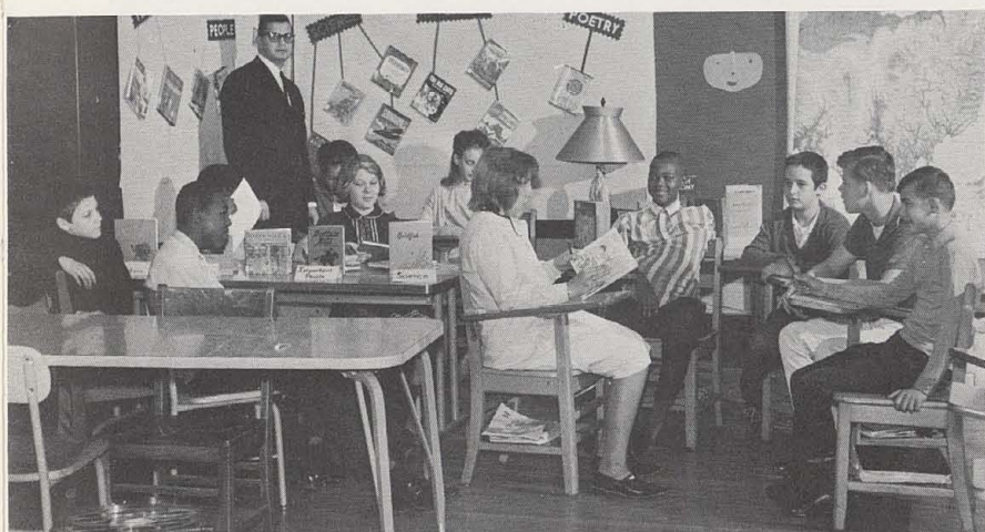
The Special Education class is engrossed in a study of literature.