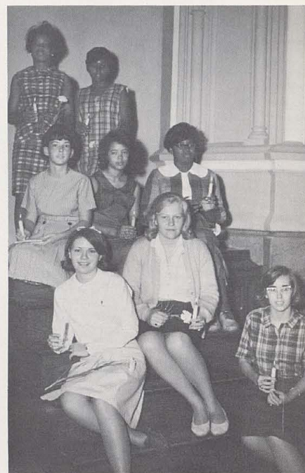
Y-Teens Executive Board.