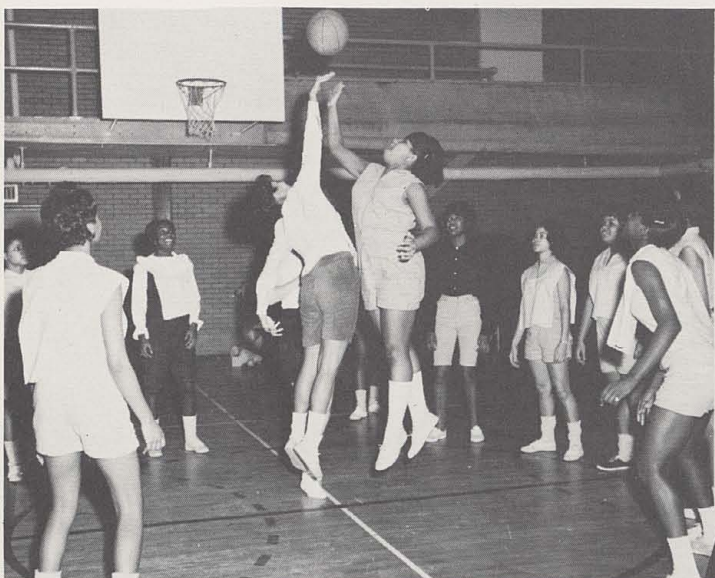
A jump shot starts off another quarter of play in this exciting game.

Practice makes perfect and the girls are ready for the basketball playday.