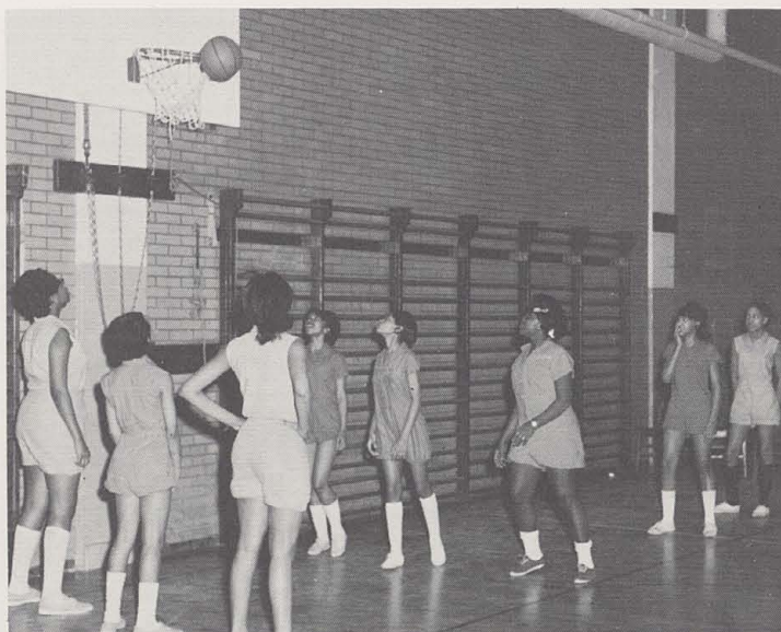
Free-throw shooting is just one of the many fine points of basketball practiced by the girls. It appears that this shot won't make it, girls!