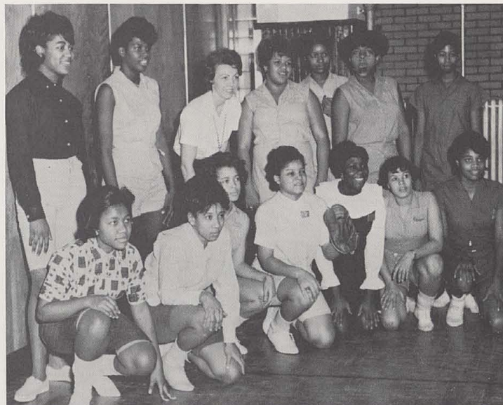
Senior high girls out for softball pose for camera. They made a hit!