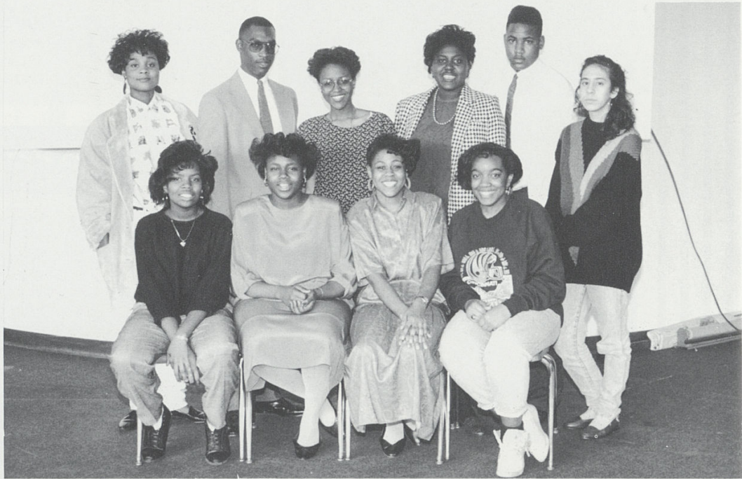
Class of 1990 Officers