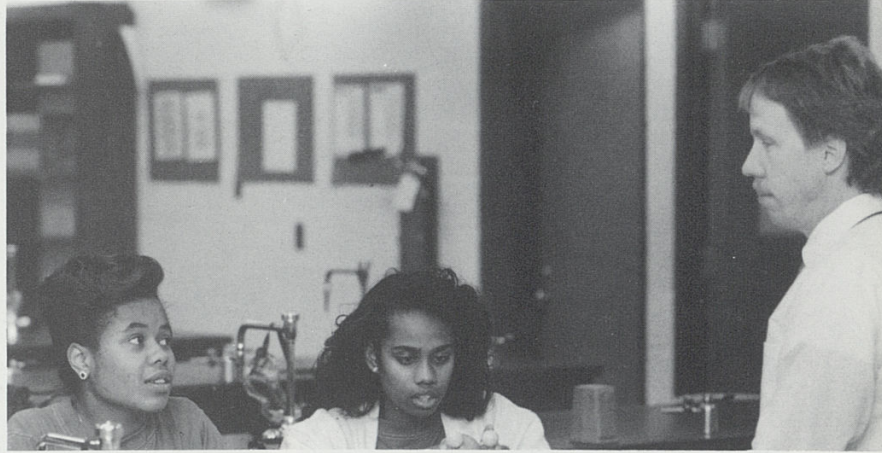
Teachers just want to have fun.