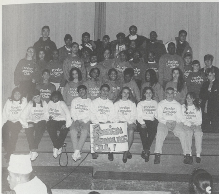
FORIEGN LANGUAGE CLUB