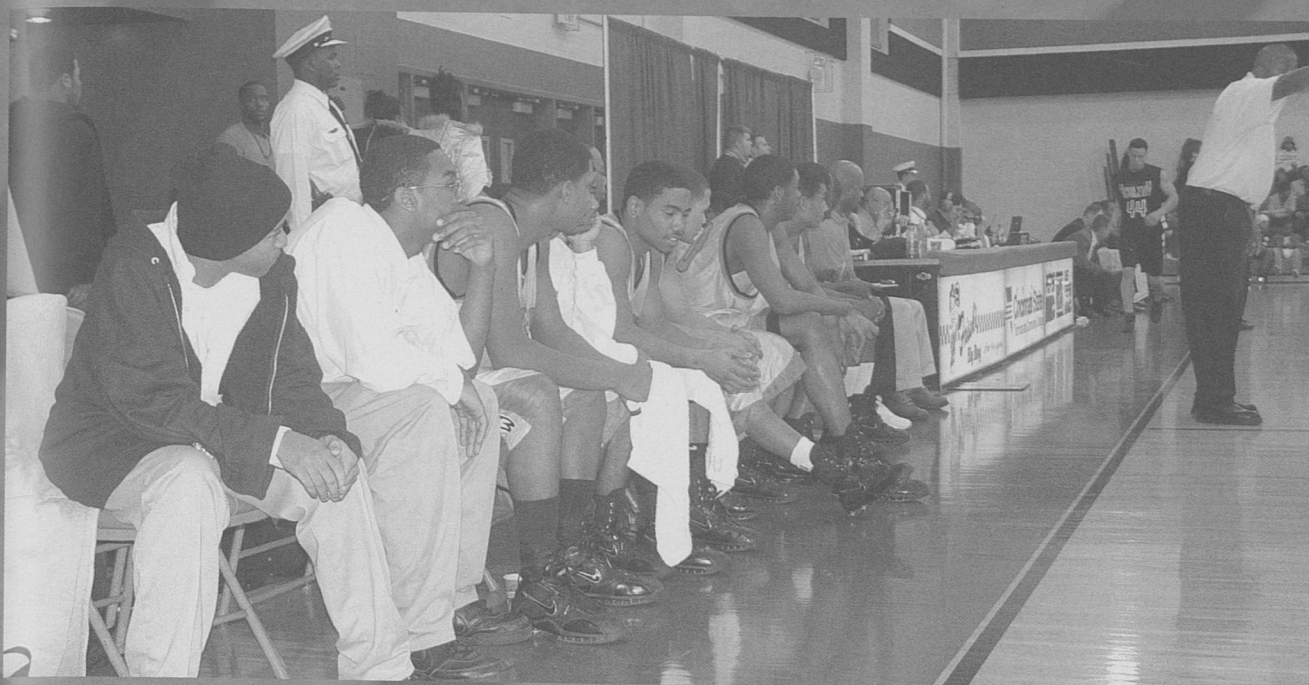
Offside the court, Tigers rest up and watch the action on the floor