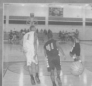
Moving down the court