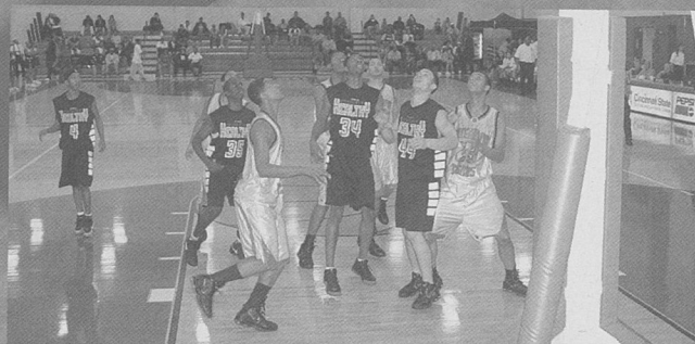
Awaiting the rebound