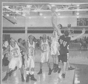
Every shot counted in the game against Mt. Healthy. Victorious tigers won with a score of 68 to 56.