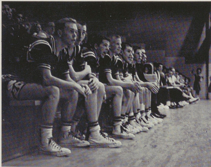
The bench shouts its support to those on the court.