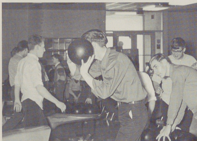
STRIKE another one up for the Schoenling All-Stars.

The intramurals are one of the activities with the largest participation throughout the school year. These organized sports develop the spirit of competition and fair play in the boys participating, as the homerooms battle each other to attain victory and win the prize of the coveted Spirit Banner.