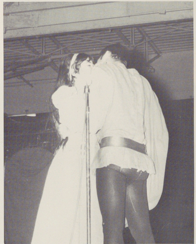
Stand back kiddies or he'll melt your ice cream!