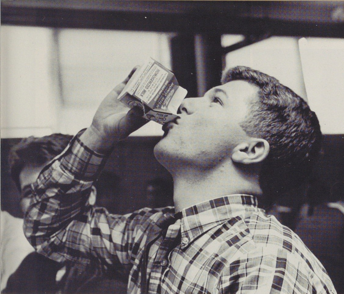
Homogenized one-hundred proof?