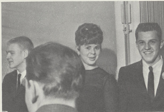
"Get your fat head out of the picture."