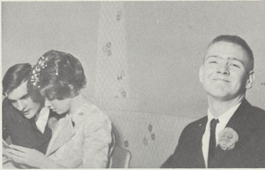
"They're looking at my baby pictures."