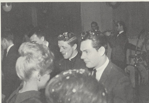
"Our group has 34% more dandruff."