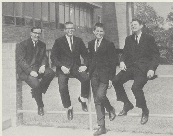
The Debating team just took the toothpaste test.

Much thanks should also be given to the Welfare who financed the Washington Trip and also financed the studying of methods in speech and debate at various colleges by some of the Speech and Debaters.