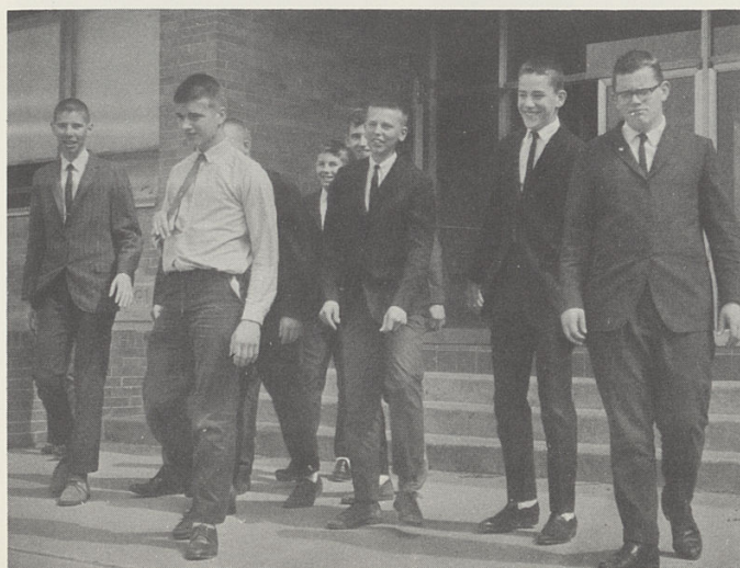
Freshman debaters surge for a meet.