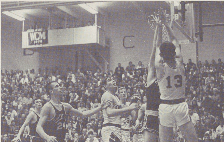
Action in the AIT championship game.