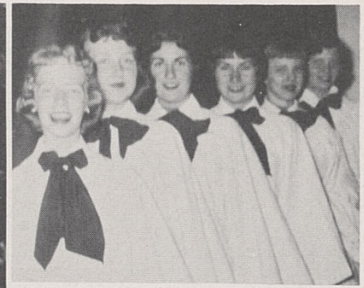
The Bishop's Ushers