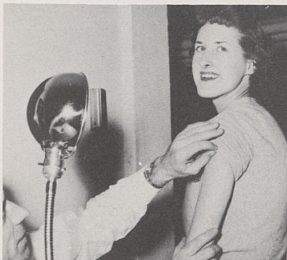
My arm for the class!