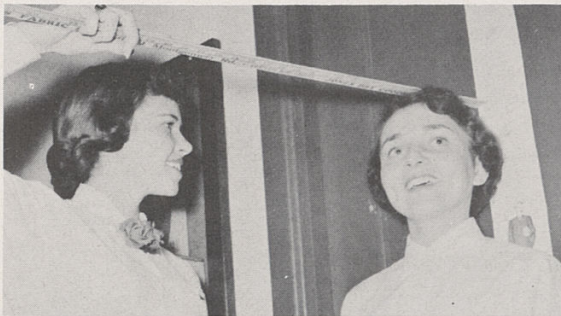
Measuring for Caps and Gowns