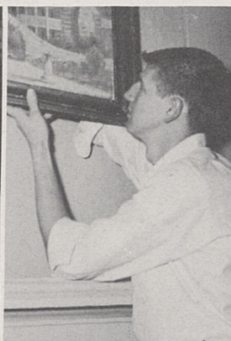
No ladder needed!