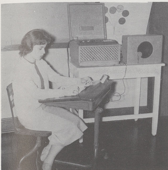
Recording, French II-304—A modern method of analysis.

merely exist to add spice to the main purpose of school, education and preparation for later life. The student must never forget that he is a student. He will be a professional doctor, lawyer, or something-or-other in the future, and as he is NOW a professional student he must do his absolute best to be an expert in his field.