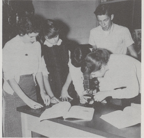
Biology—The study of life.

merely exist to add spice to the main purpose of school, education and preparation for later life. The student must never forget that he is a student. He will be a professional doctor, lawyer, or something-or-other in the future, and as he is NOW a professional student he must do his absolute best to be an expert in his field.