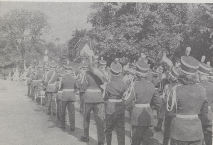
Memorial Day Parade