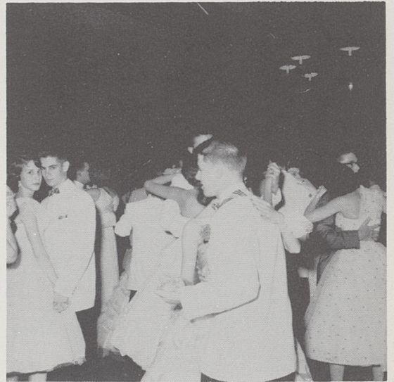
Sociability is a big part.