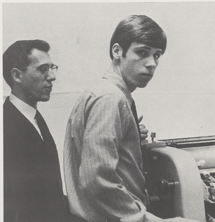
"It was either this or the library staff!"