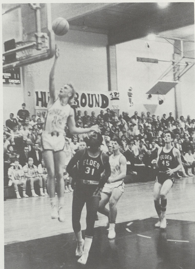
Buddy Gets an Easy Two.