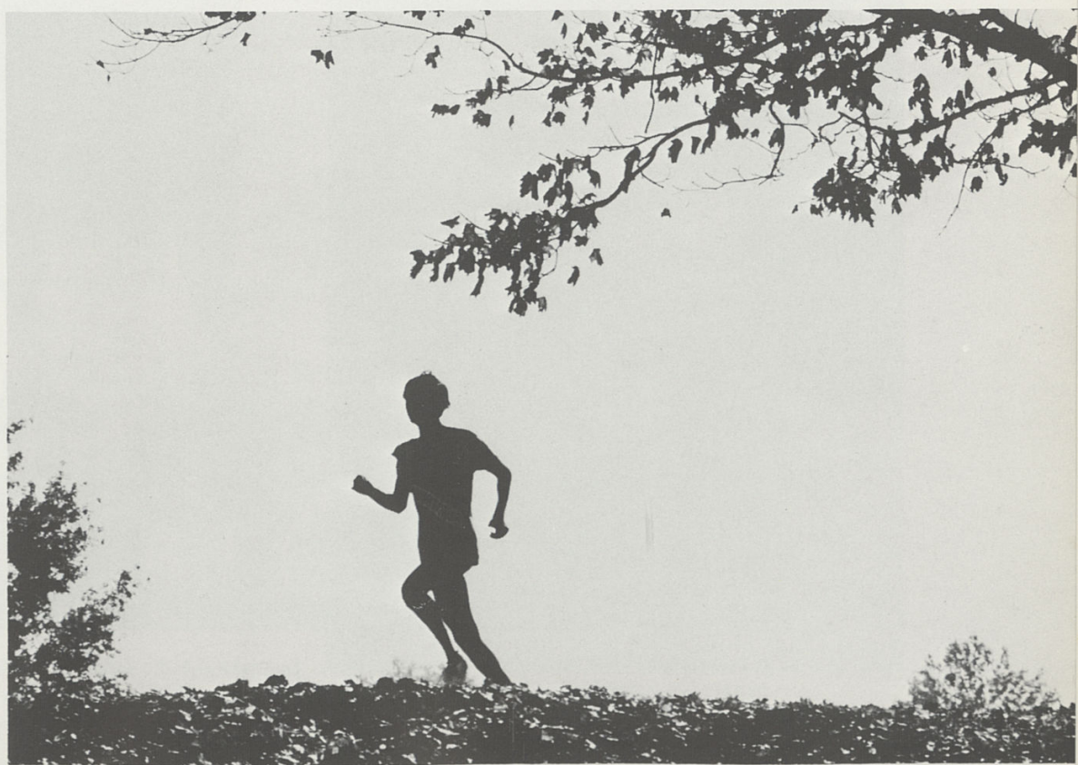
A Portrait of the Runner.