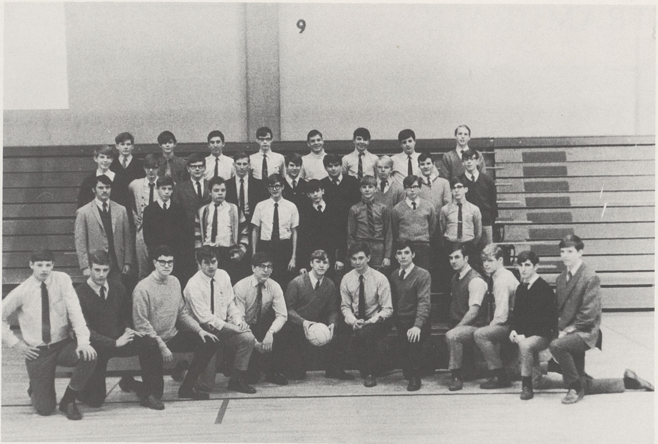
Intramural Volleyball Champs - 2G