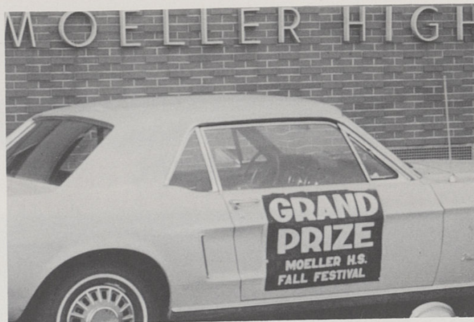
The '68 Mustang sits idly in Moeller's front yard.