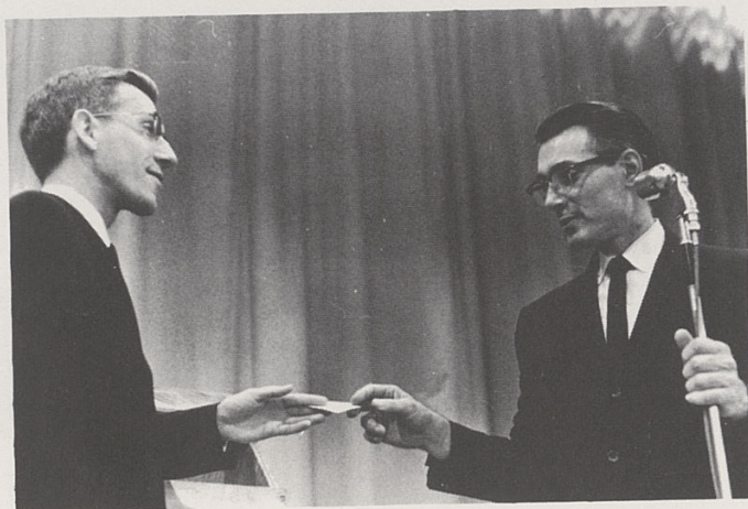
Don't say I never gave you nothing.