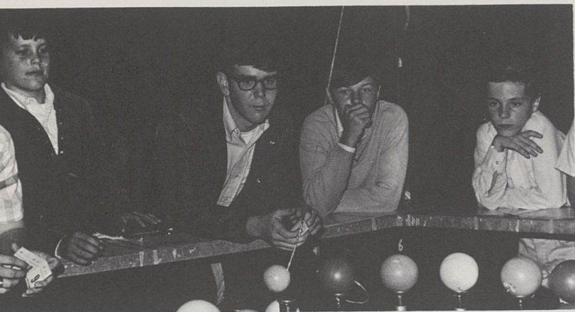
There must be a better way to spend Sunday afternoon.