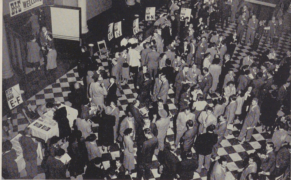
The educators met at Music Hall before embarking on their tours.