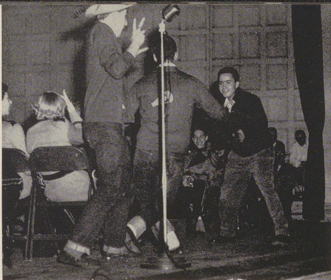
"Central Hornets" are routed at a pep assembly.