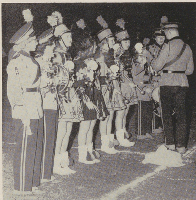
Senior girls receive flowers, a token from band.