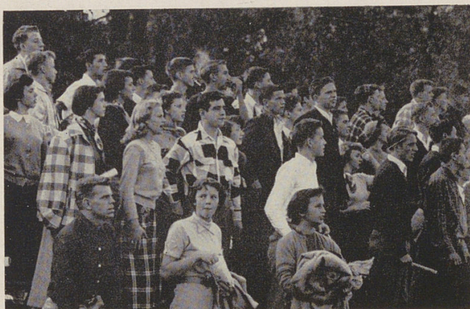
Loyal fans travel to Shortridge to back the team.