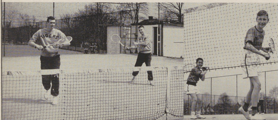
At the end of their first seven net frays, the junior racket men were undefeated.