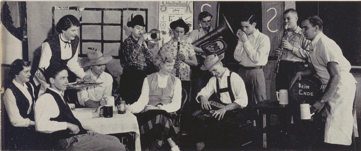
An Alpine motel provides a rustic setting for a German Club fall meeting.