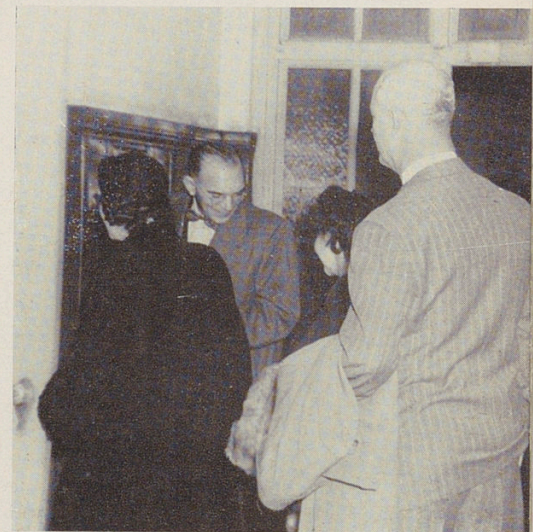
Well, soon they will know all!

There comes a time in all parents' lives when they have the opportunity to see the inside view of "Junior's" vigorous school life. This opportunity comes once a year on what is called Parent's Night . This is one night "Junior" is wholly smiles as he proudly displays the notebooks and projects he has struggled over so tediously during the previous weeks and months. Also at this time, the parents are able to see the true picture of the close teacher-student relationship which is a traditional existence at Withrow High School .