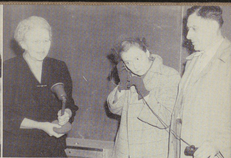
Visiting parents see the hearing aids and realize the opportunities these instruments offer oral classes.